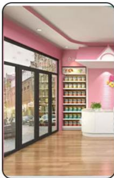
Maternity and baby store