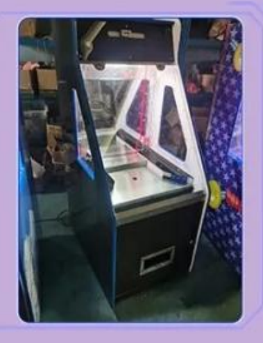
Size:60*85*145 Bonus hole Skill Stop All coin type Bonus funnel